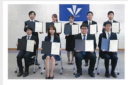
“Specialist in Regional Development” recipients of the 2020 Fiscal Year (left) and 2019 Fiscal Year (right).