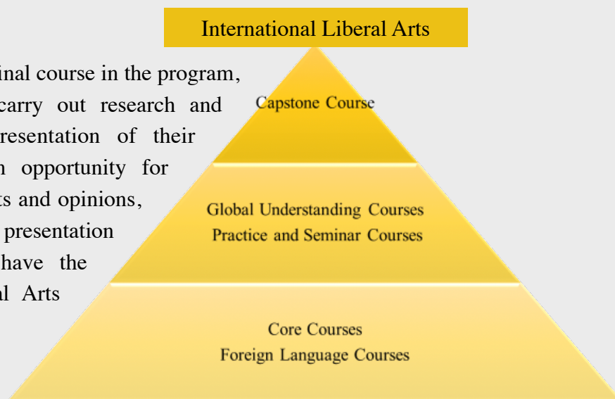
Course structure of the International Liberal Arts Program

The Capstone Course, which is the final course in the program, asks students to set a theme to carry out research and investigation, culminating in a presentation of their academic results. By providing an opportunity for students to express their own thoughts and opinions, they will be able to improve their presentation skills and confirm whether they have the insight of the “International Liberal Arts Specialist”.