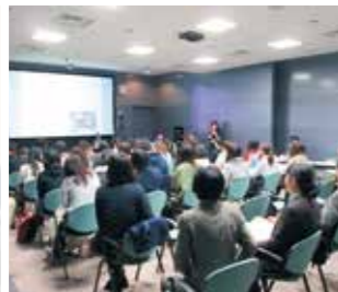
Video Conference in AV hall