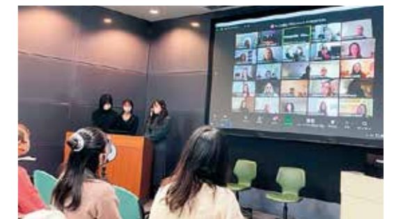
The students giving the presentation