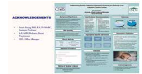
Poster introduced in the presentation

A family nurse practitioner (FNP) presented her research on an initiative to conduct screening using the Edinburgh Postpartum Depression Screening form (EPDS) administered to postpartum mothers in a pediatric outpatient setting.