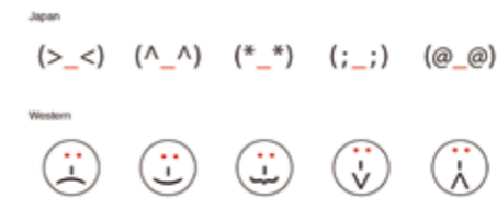
The differences of Emoticons in the U.S. and Japan

As background, there are cultural differences in which parts of the face are emphasized in communication. They showed the difference in the impact of covering the mouth with a mask because the mouth is more important in the U.S., while the eyes are more important in Japan. The slide also showed how emoticons used in SNS also reflect an awareness of the parts of the face that express emotion.