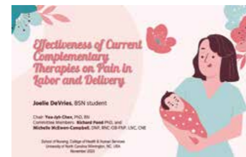
UNCW student's presentation

A UNCW nursing student gave a presentation on the effectiveness of alternative therapies for pain in labor and delivery. She reported on a systematic review of non-pharmacologic therapies, although epidural anesthesia and opioid analgesics are the most common methods of pain relief in the U.S.