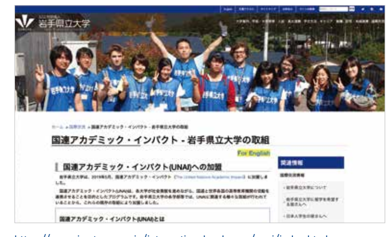
to undertake activities for at least one of the 10 UNAI principles and submit a yearly activity report to the secretariat of the UNAI.

In each year, UNAI member institutions are required